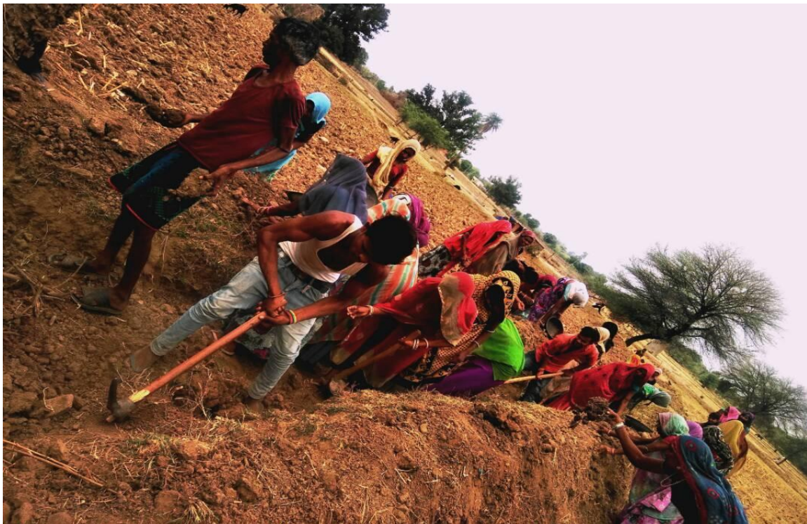
Shramdan by villagers in, Banswara District, Rajasthan