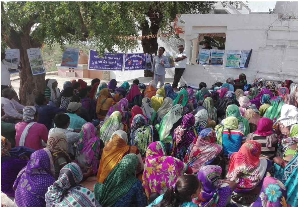
Women participation in village campaign, Sabarkantha district, Gujarat