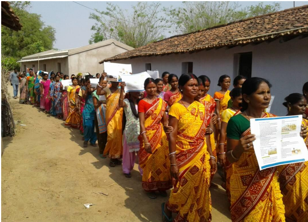
Women participating in Walkathon in Jhikpani block, West Singhbhum, Jharkhand