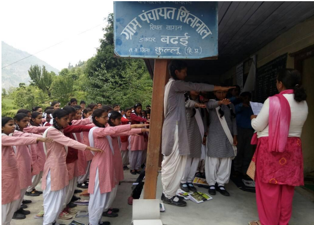
School children taking oath during village programme, Himachal Pradesh