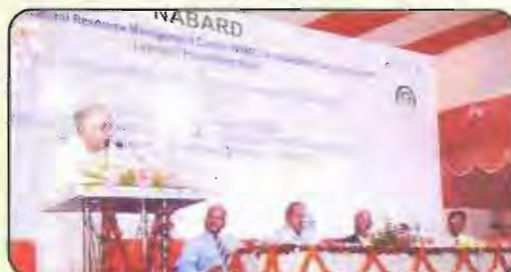
Laying of Foundation stone of NRMC, Kolkata