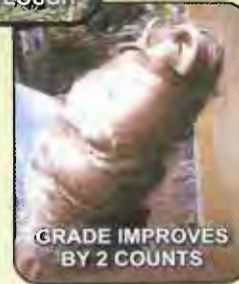
GRADE IMPROVES BY 2 COUNTS