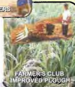
FARMER'S CLUB IMPROVED PLOUGH