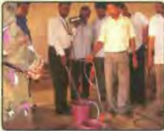
Solar pump set financed under EPA

In West Bengal, three projects involving Rs. 3 lakhs are in progress in Hooghly, Jalpaigudi and North 24 parganas.