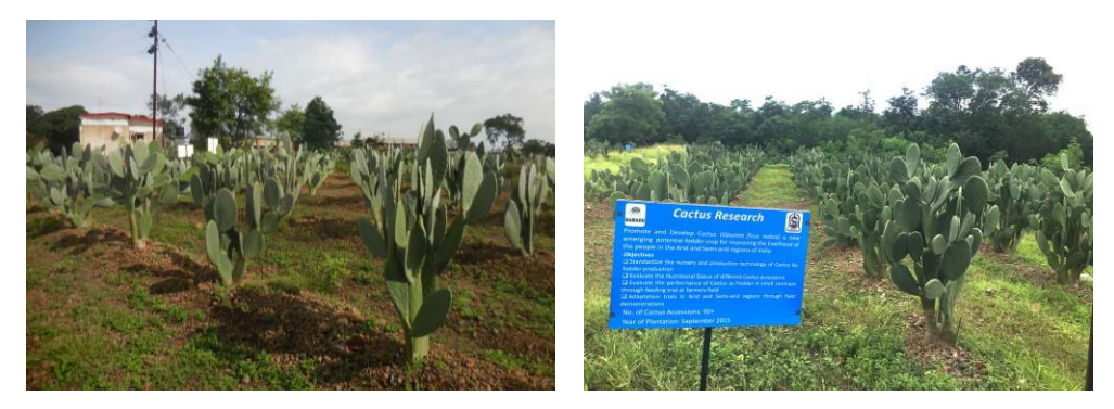
Cactus arboretum at BAIF, Urulikanchan