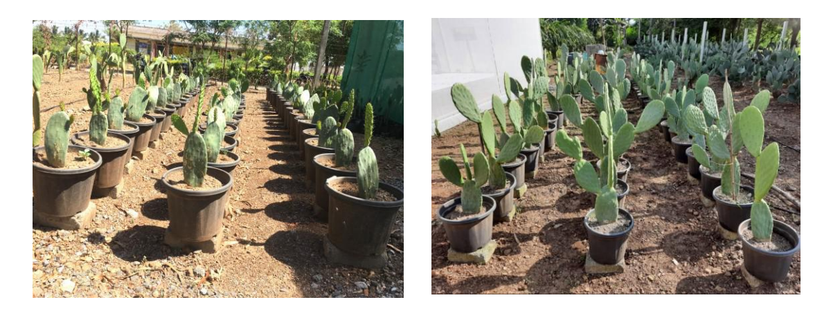
Pot trial experiment on Water Use Efficiency in Cactus at Urulikanchan

The water-use efficiency value for 1 year old Opuntia ficus indica was obtained by measuring the relative growth rate / amount of water lost from soil due to evapotranspiration over a period of one month in a pot culture experiment. Above-ground fresh and dry matter production was obtained by complete harvest of the plants. Evapotranspiration was estimated as the change in soil water content and plant water content, as applicable to succulents (Han and Felker, 1997). The water content at field capacity (WFC) was measured using a pot in which no plant was grown (Table 10).