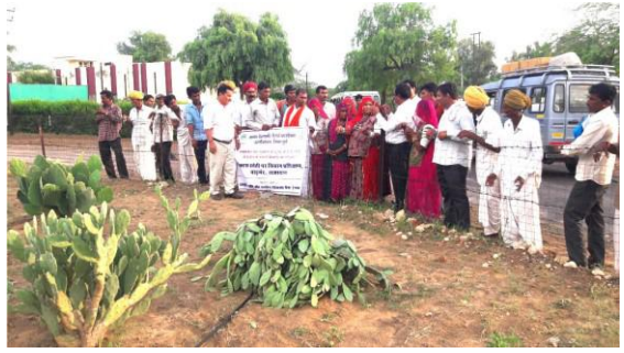
Farmers training cum exposure to CAZRI-RRS, Bikaner