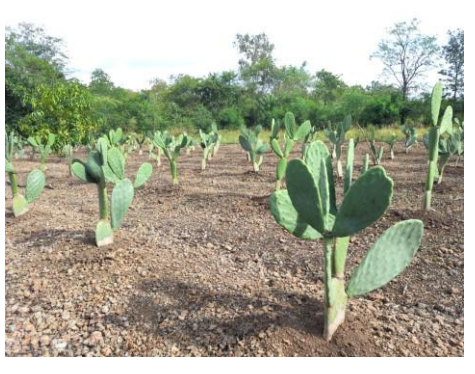
New cactus accessions received from ICARDA growing at Urulikanchan