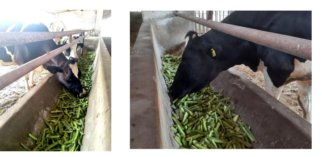
Cactus feeding trial in milking cows at BAIF, Urulikanchan