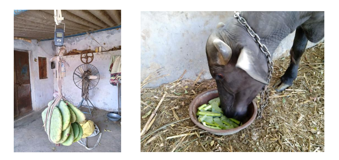
Cactus feeding to buffalo at farmer's field in Raper, Bhuj

Results: The results of the experiment indicated that buffaloes in experimental group fed with cactus gained higher total body weight of 5.83 kg and average daily gain in body weight of 95.57 g/day over the control group where the values were 3.00 kg and 49.18 g/day. It was also found that the water intake by buffaloes fed Cactus was reduced by 35 %. The milk yield was not influenced in both control and experimental groups.