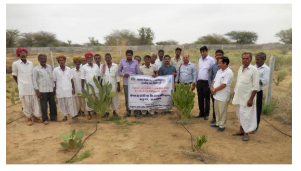
Farmers training cum exposure to BAIFs Desert Research Center, Undkha, Barmer