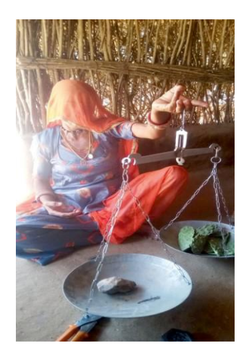
Cactus feeding in goats on farmer's field at Barmer

Results: The results of the experiment indicated that goats in experimental group fed with cactus gained higher total body weight of 3 kg and average daily gain in body weight of 75 g/day over the control group where the values were 1.25 kg and 31.25 g/day. It was also found that the water intake by goat fed cactus was reduced by 33 %.