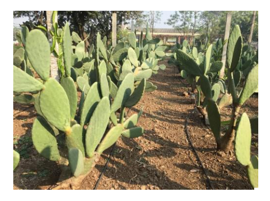
Cactus Nursery at BAIF, Urulikanchar