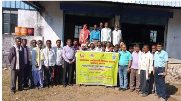
Farmers training conducted on cactus cultivation under ICARDA project at Nagpur