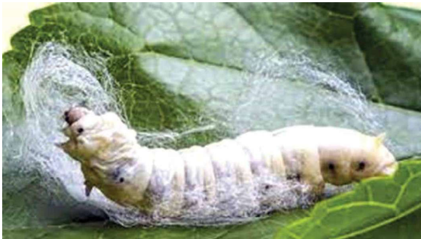
Silkworm used for Tasar Silk Rearing